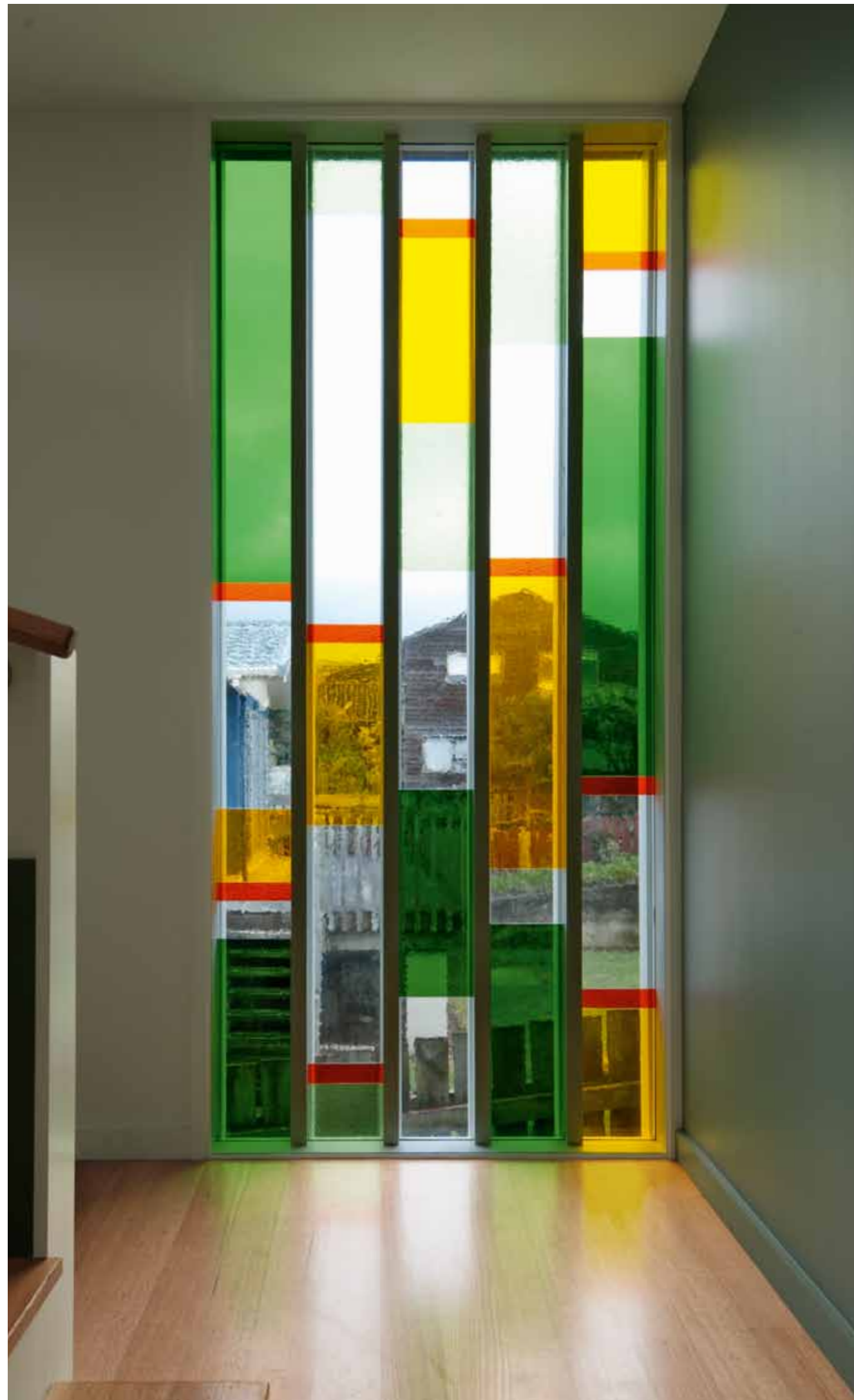
The striking stained-glass panel that greets visitors as they enter continues the bold use of colour on the bach's exterior.